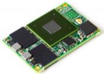
Figure 1: SOM View

The iMX6 series of energy-efficient processors is a scalable multicore platform that includes single, dual and quad-core families based on the ARM® Cortex® architecture. The Family targets consumer, industrial and automotive applications.